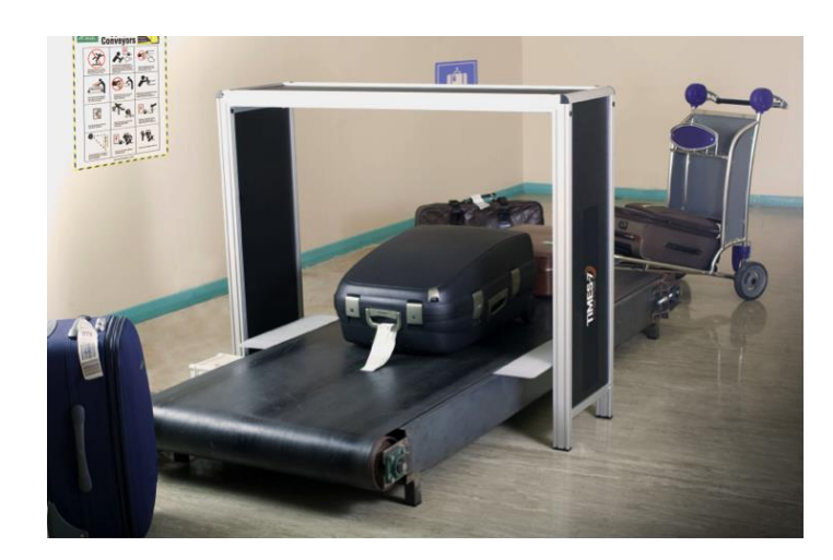
A6020 Conveyor Belt Portal System

The A6020 Conyeyor Belt Portal System is a latest generation portal for conveyor belt-based UHF RFID applications.